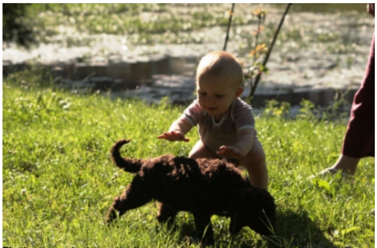
Aberleandeterns vehives continues has no problems with other animals like other dogs, cats...